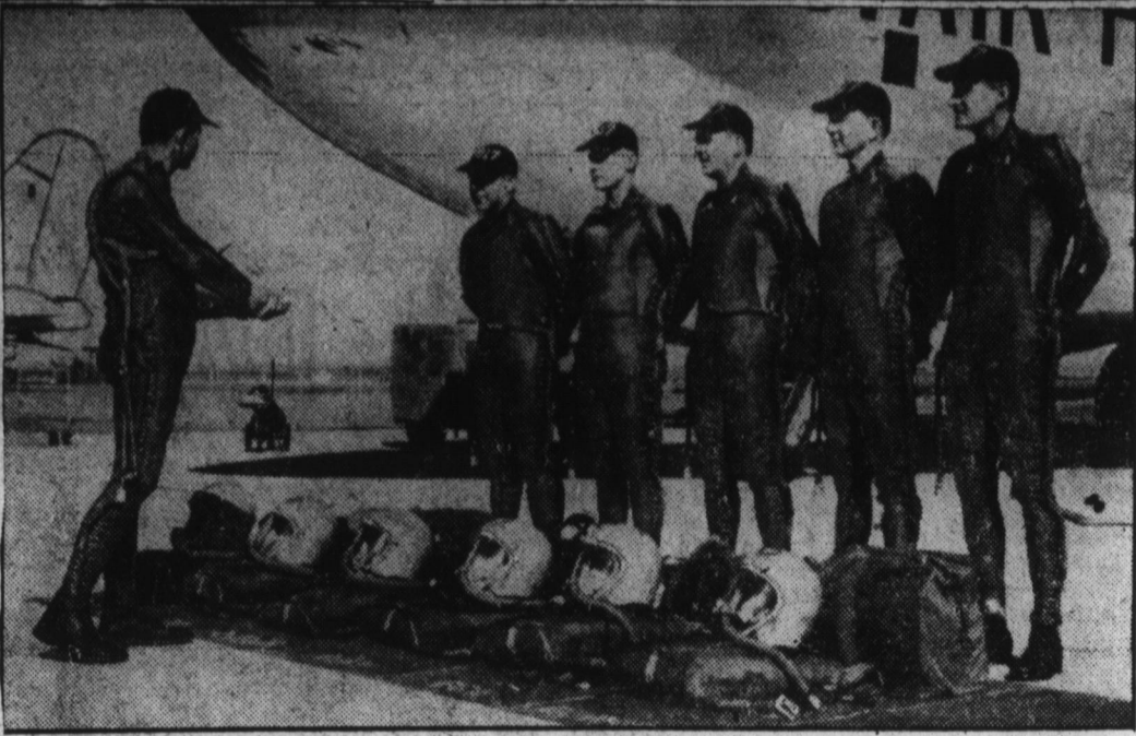
SUITED FOR TROUBLE —Crewmen of an Air Force B-52 Superfortress line up for briefing clad in skin-tight pressure suits at Castle Air Force Base, Merced, Calif. Ribbing on suits is composed of a series of tiny bellows which can be expanded by means of pressure hoses or inflation bottles. Pressure helps prevent damage to organs or circulatory system at extreme altitudes or in case of pressure failure in the plane's cabin.