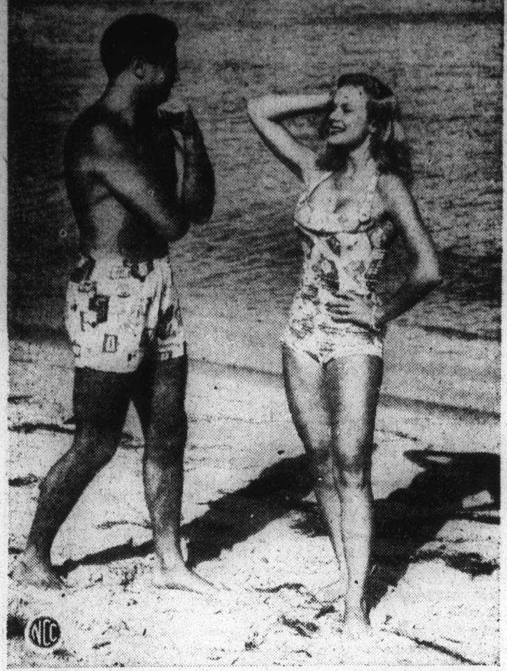
TRAVEL-TAG COTTONS—These swimsuits by Gantner of California are bright with airline travel tag designs, sunglasses and other picturesque patterns which evoke memories of remote vacation lands. Girl's suit features a neckline upsweep with wide straps that button on to a curving collar. Man wears matching Wikies.