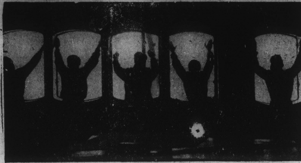
REACHING FOR THE SUN —These shadowed figures, silhouetted against the bright windows, aren't prisoners looking to escape, but glaziers fitting glass panes. They're working on the upper-most deck of the Swedish-American luxury liner Gripsholm. The 23,000-ton ship is being readied in Genoa, Italy, for its maiden voyage to the United States next summer.

Now let's take a look at the budget. An electric dryer permits the growing child's washable wardrobe to be reduced to half. Even the cuddly toys Santa left look like new and last longer when dried electrically! Fabrics hold their new appearance longer: resin-finished cottons retain crisp appearance, pile fabrics stay soft and