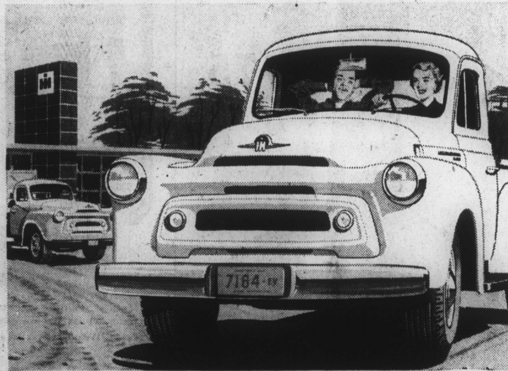
Trucks for every job, from the world's most complete truck line—½-ton pickups to 90,000 lb. models.

Talk is cheap. So we don't just tell you INTERNATIONAL'S your best truck buy for comfort.