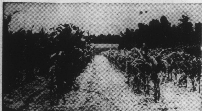
See how the extra value in Chilean Soda makes an extra good crop of corn. Chilean is a natural combination of nitrate nitrogen, sodium and minor elements.

and you'll choose CHILEAN NITRATE OF SODA