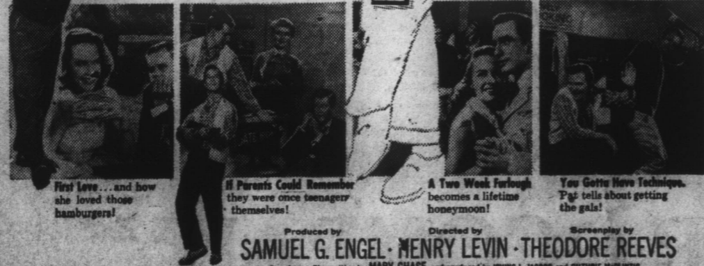
First love... and how she loved those hamburgers!

Starring PAT BOONE TERRY MOORE JANET GAYNOR DEAN JAGGER