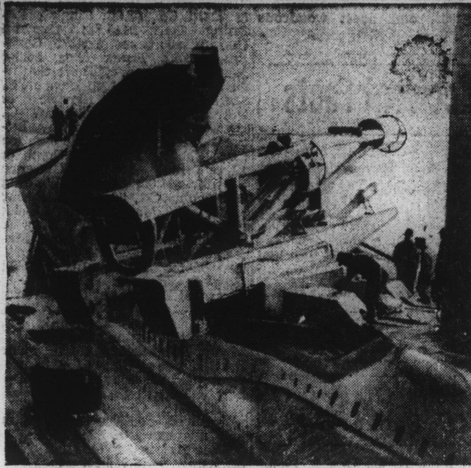
THE FLYING GAS PIPE —The gadget shown on the launching pad of the submarine USS Growler, at Portsmouth, N.H., is a stand-in for a Regulus II missile. Some 13 tons of concrete-filled steel pipe and assorted hardware, it duplicates weight and balance of the more expensive missile. What's more, the dummy can be recovered and reused.

The speech was regarded as of highest significance, since it went farther in this direction than any other Administration official has ever gone publicly. There was