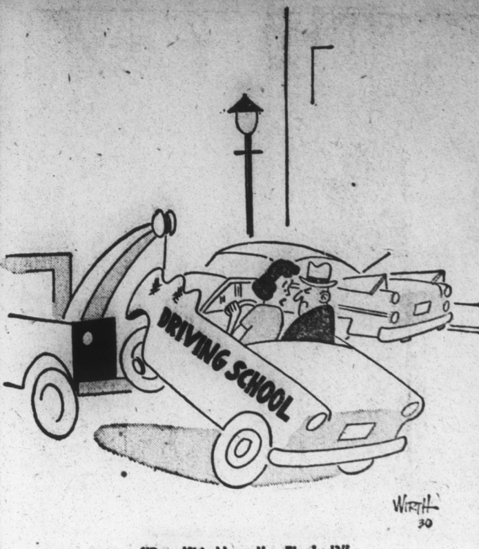
"Does This Mean I've Flunked?"

Good Reading for the Whole Family • News • Facts • Family Features The Christian Science Monitor One Norway St., Boston 15, Mass. Send your newspaper for the time checked. Enclosed find my check or money order. 1 year $18 6 months $9 3 months $4.50 Name _____ Address _____ City _____ Zone _____ State _____