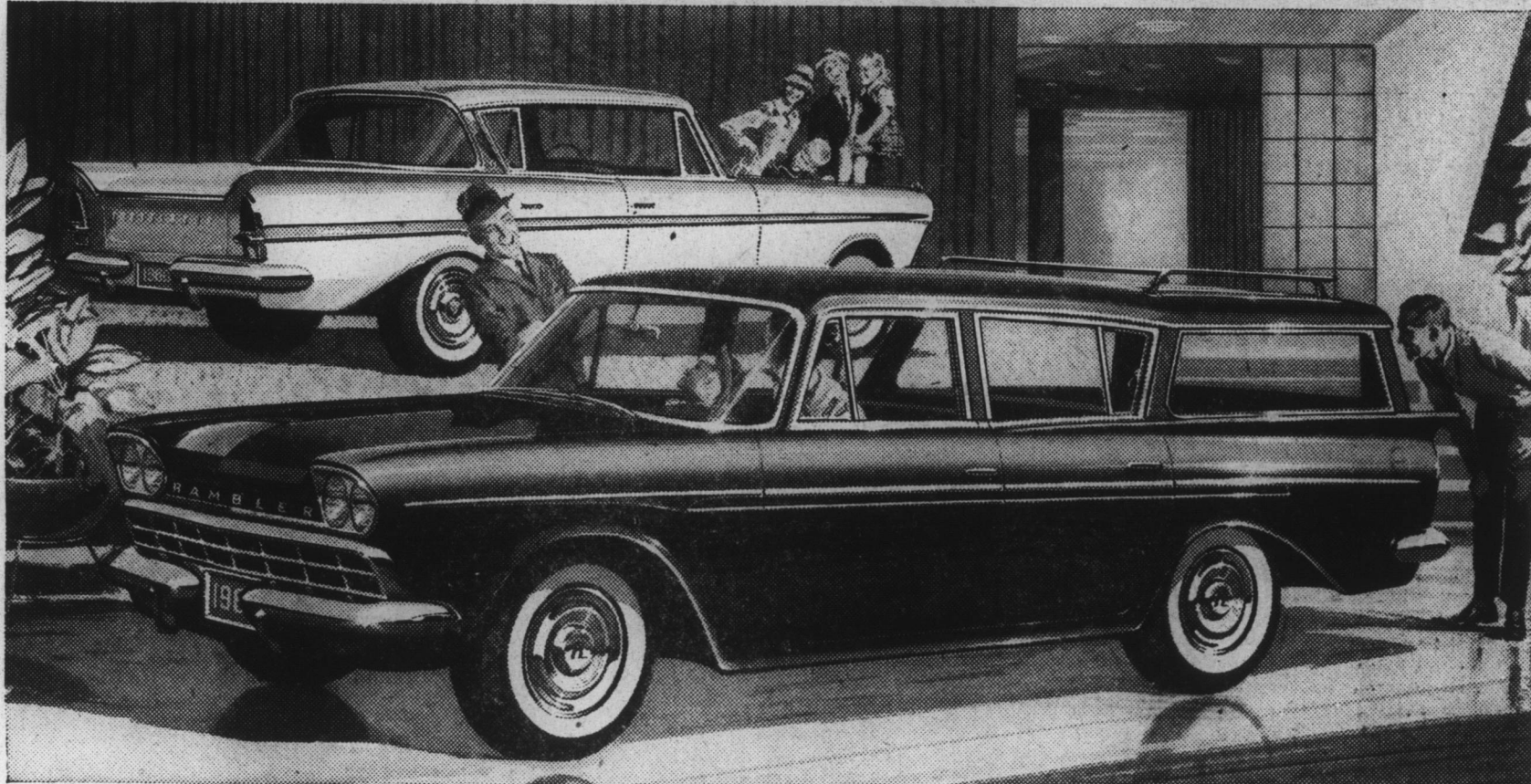
1960 RAMBLER CUSTOM CROSS COUNTRY—newest edition of America's compact station wagon leader. Six, Rebel V-8, Ambassador V-8. 2 or 3-seat models.

FROM THE WORLD'S LARGEST BUILDER OF COMPACT CARS