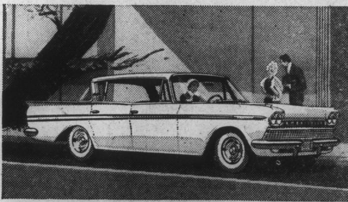
1960 Ambassador V-8 by Rambler—The compact luxury car with new improved fuel economy.

FROM THE WORLD'S LARGEST BUILDER OF COMPACT CARS