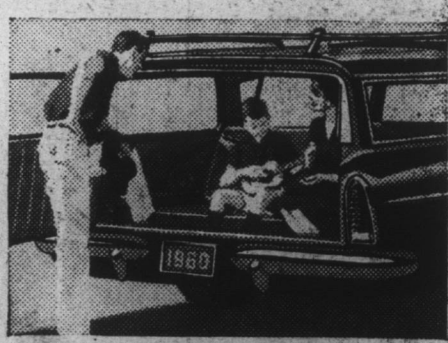
3 WIDE SEATS, 5 BIG DOORS. Room for biggest families. Swing-out tailgate has positive key lock so children can not open it. No climbing over seats or tailgate to get in third seat.

See styling that's fresh, exciting, tasteful. See entirely new models. High, wide doors let you step in, not stoop in. See the new standard of basic excellence at your Rambler dealer October 14.