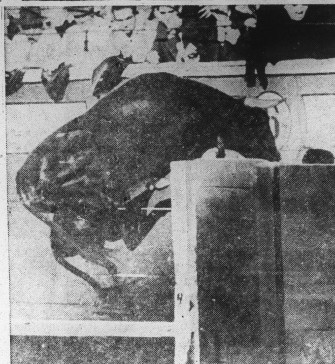
NOT-SO-BRAVE BULL—Panicked by the cheering crowd, a bull in a Madrid, Spain, ring heads for the stands in a mighty leap. He didn't make it.