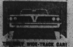
THE WIDE-TRACK GARI Pontiac has the widest track of any car. Body width trimmed to reduce side-swaying. More wheel balance to keep the wheels for sure-footed driving stability.

A completely new fuel induction system gives this new free-breathing V-8 more air... to save you gas. Closer calibration of this big 389-cubic-inch engine gives you maximum thrust at half-throttle without over-carbureting. We made the engine lighter, mounted it lower for better balance. An oil refill now takes only 4 quarts. Tailor your Pontiac power plant to your needs. There are 11 versions to choose from. Horsepowers range from 215 to 348. (For best economy, specify the Trophy Economy V-8. Its lower compression lets you use regular gas.) If this sounds a bit technical, just try a new Trophy engine soon. It's in all four Pontiac series. In one block, it will become clear why we've called this '61... all Pontiac!