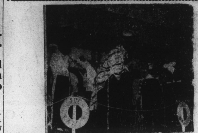
Pictured above is a scene in the Rocky Hock minstrel, "Cotton-town Carnival," which will be presented in the Edenton Elementary School auditorium Thursday night, February 23, at 8 o'clock. Proceeds from the repeat performance will go to the Rocky Hock baseball club and the John A. Holmes High School Band.