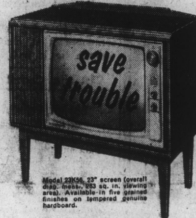
Model 22K56, 22" screen (overall size: 22 1/2" x 15 1/2" in. viewing area). Available in five grain finishes on tempered synthetic hardboard.