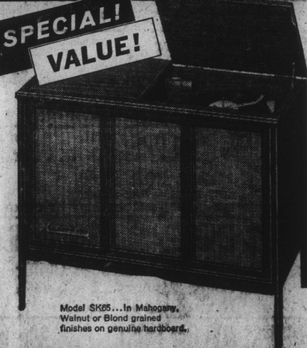
Model SK65 . . . In Mahogany, Walnut or Blond grained finishes on genuine hardboard.