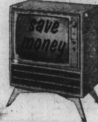
Model 28K57, 23" screen (overall size: 23 1/2" x 15 1/2" in. viewing area). In Mahogany, Walnut or Blond grained finishes on tempered genuine hardboard.