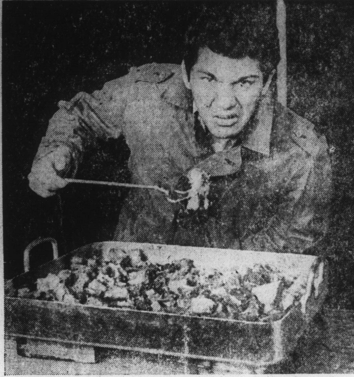
MESS —Singer-actor Paul Anka samples real Army chow on the set of his newest film in London. His face tells the whole story: use of Army food is carrying realism in the movies a little too far. Yet it's only one man's opinion.