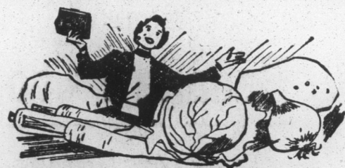
IDEAL FOR SALADS — GOLDEN

SAVE CASH ON A&P FRESH FRUITS AND VEGETABLES