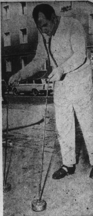
EAR TO THE GROUND —Listening with his "geophon," this expert from the Vienna, Austria, water works searches under the street for defects in the piping, 30-feet below.

Serve wagon wheel turkey sandwiches with western-style barbecued beans and plenty of cold delicious milk.