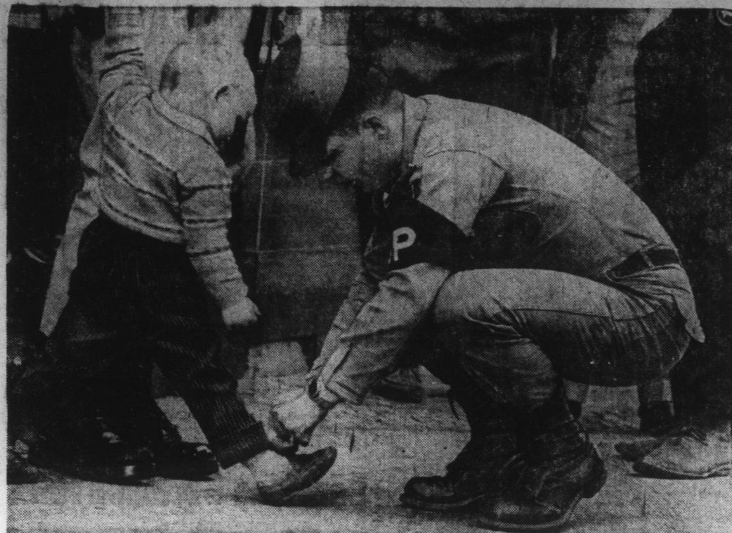
BEYOND THE CALL OF DUTY —West Berlin lad holds foot out so that an American M.P. can tie his shoelace. Is this what is meant by foot soldiers?

"American investors paid $4.5 billion in taxes to foreign governments abroad."