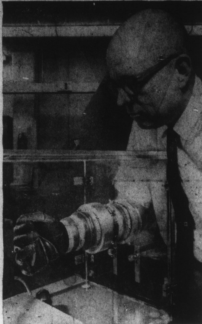
MOON-REACHING — Minneapolis, Minn., engineer works on Project Apollo. He is thrusting his hand into "space" by putting his arm into a special vacuum chamber. It will help him design astronauts' suits.

Aid to the permanently and totally disabled is for needy persons between the ages of 18 and 65 who are physically or mentally unable to work. These persons must be making their home in this state; must not have the essential requirements of daily living such as food, job application, or an insurance