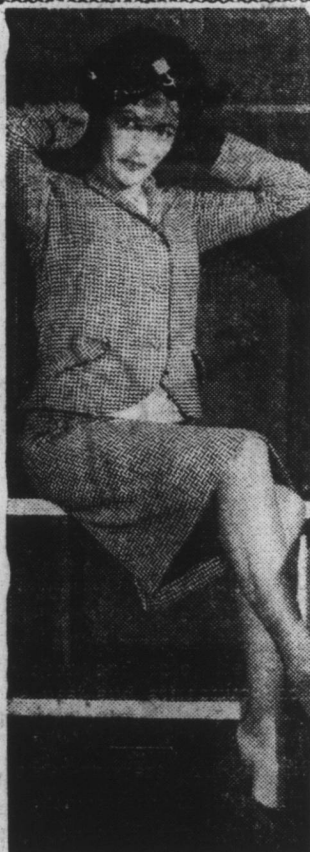
STAR BRIGHT —Yvonne De Carlo was caught primping for the camera as she arrived in New York from Hollywood in connection with the opening of her movie, "McLintock!"

Officers were installed for Unanimity Lodge No. 7, A. F. & M.