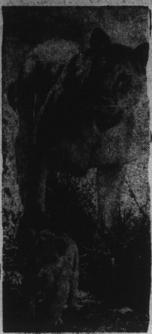
PROUD OF LION —Princess appears fiercely proud as she follows her male cub, Lee, on his first walk in the sun. In the shelter of his mom's well-muscled forelegs, Lee surveys the exciting world of the Bronx Zoo, in New York.