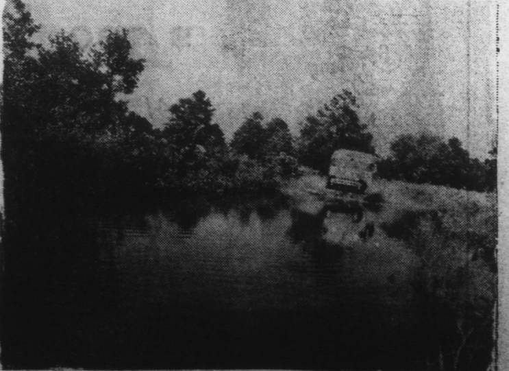
School bus traveling flooded road in the Green Hall section in the Pollock Swamp Watershed. (Other Pictures on Page Three, Section One)