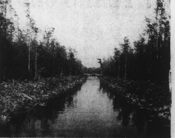
Main channel of Pollock Swamp just above N. C. 32 after construction. Sixty-five ton dragline in background performing the work. Construction will include 21.5 miles of main and lateral ditch construction in the 14,475-acre watershed.