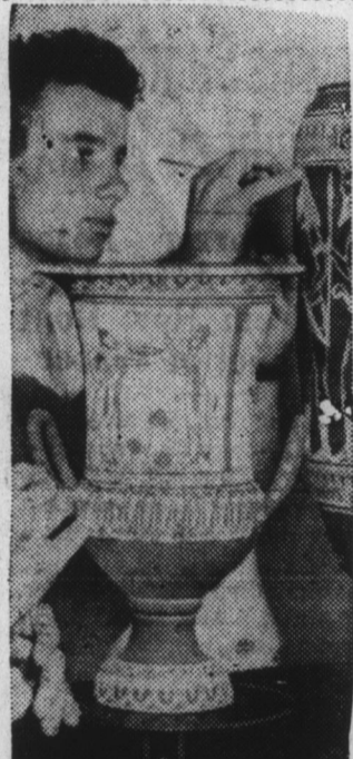
ANCIENT ART —Working with delicate tools, a craftsman carves out a design on a large vase at a small pottery factory in Civita Castellana, Italy.

Don't forget to display your flag Saturday—Memorial Day.