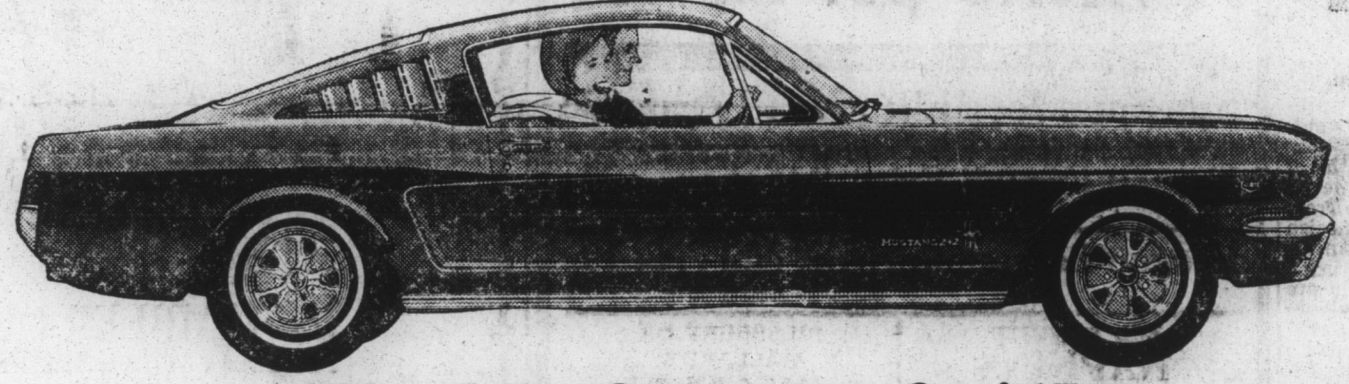
of Total Performance for '65 THE TOTAL PERFORMANCE MUSTANG 2+2