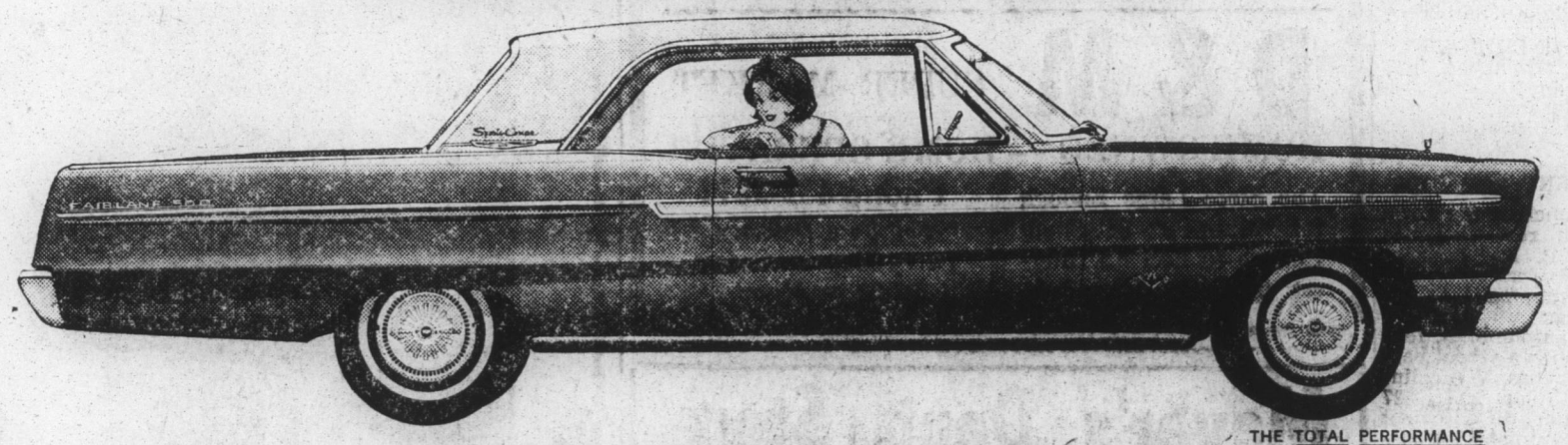
THE TOTAL PERFORMANCE FAIRLANE 500 SPORTS COUPE