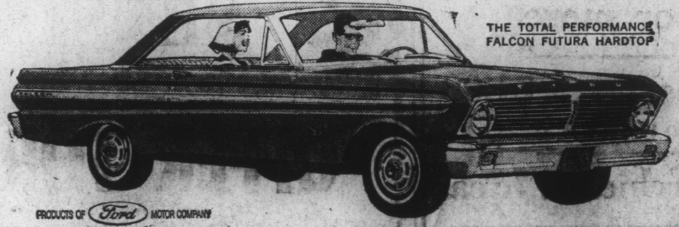
THE TOTAL PERFORMANCE FALCON FUTURA HARDTOP

From a new reversible key to a brand-new luxury series, the '65 Fords are so new you just have to see them for yourself. New world of elegance... 17 solid, quiet Fords, including a new super luxury series—the LTD 2- and 4-Door Hardtops. New body, frame and suspensions give the smoothest, quietest ride ever. New wider tread, new spaciousness, new Big Six engine. New "cool" world of Mustang... Fastback 2+2 joins the Hardtop and Convertible. Many luxuries standard. New options include front disc brakes. New world of value... 8 Fairlanes, bigger, handsomer, better buys than ever. A livelier, smoother new Six—2 hotter V-8 options. 3-speed Cruise-O-Matic optional. New world of economy... 13 Falcons with up to 15% greater fuel economy as a new livelier Six teams with optional 3-speed Cruise-O-Matic. New battery-saving alternator.