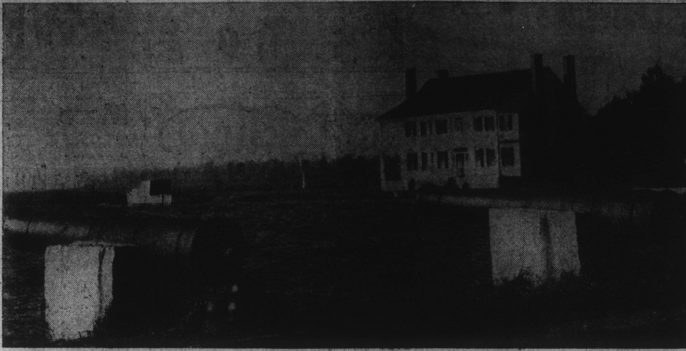
Water in the Albemarle Sound appears as a plowed field outside the Barker House as fall winds blow in from the south. This photo, taken from Water Street, shows the Edenton landscape as it looks in the early morning sun. This is a typical scene in the Chowan capital these days as the area continues to enjoy Indian summer. The cool, crisp nights and the sunny days are being enjoyed by all—and makes for a good conversation piece.