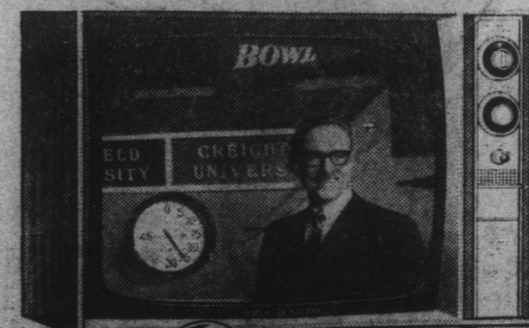
Model PAM719AWD Daylight Blue Picture