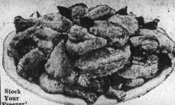
Stock Your Freezer!