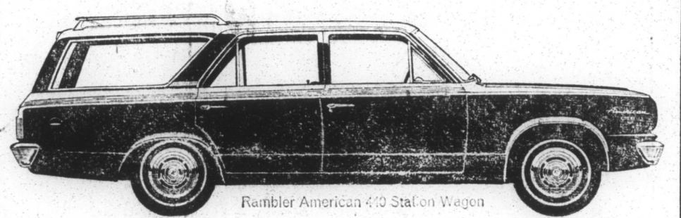
Rambler American 410 Station Wagon