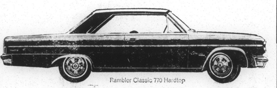
Rambler Classic 770 Hardtop