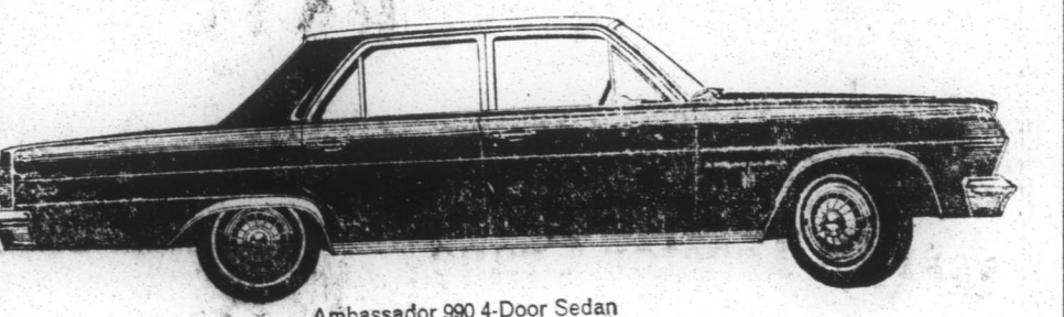
Ambassador 990 4-Door Sedan

MANY MORE STYLES TO CHOOSE FROM Prices Start at $2,183.35 Plus Sales Tax