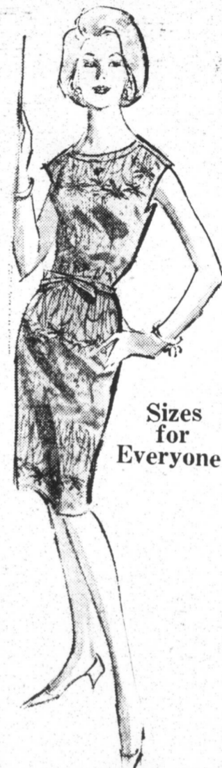
Sizes for Everyone!