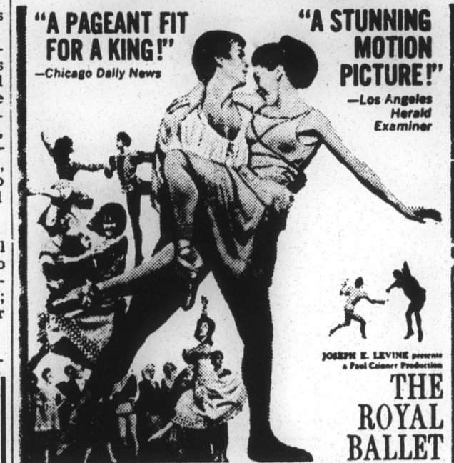
with MARGOT FONTEYN RUDOLF NUREYEV