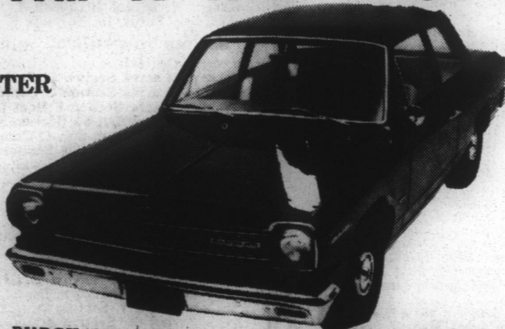
PURCHASED FROM EDENTON MOTOR COMPANY