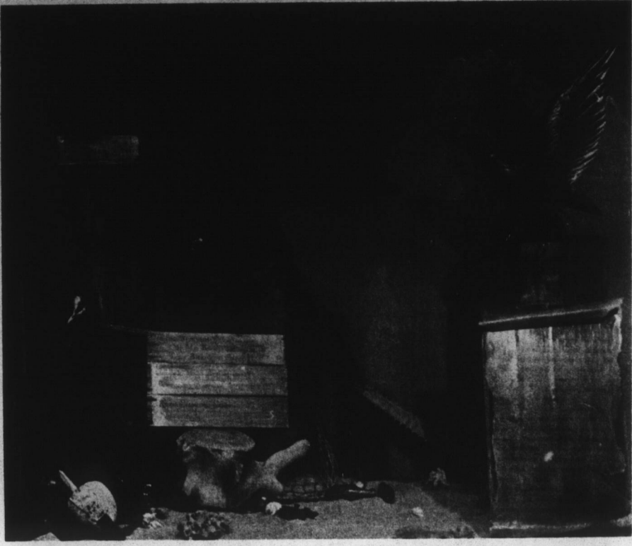
NEW EXHIBIT—Beach Combing, an exhibit emphasizing the objects which can be found on the beaches of the Outer Banks, is one of the feature exhibits of the new Museum of the Albemarle which opens to the public Monday.