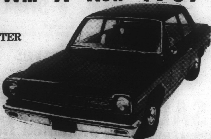
PURCHASED FROM EDENTON MOTOR COMPANY