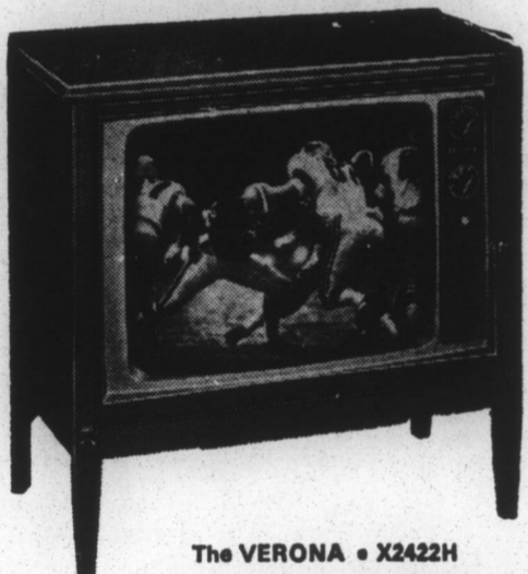
The VERONA • X2422H Elegant Italian Provincial styled lo-boy console in grained Cherry Fruitwood color on select hardwood veneers and solids. 22,000 Volts Picture Power. 6 1/2" Oval Front-Mounted Speaker.

ZENITH HANDCRAFTED GIANT SCREEN CONSOLE TV 282 SQ. IN. PICTURE