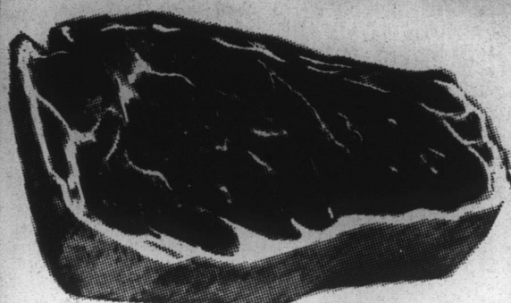
U. S. CHOICE — WESTERN