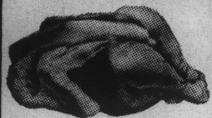
YOUNG — FOR STEWING