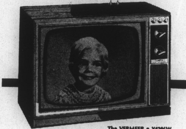
The VERMEER • Y4206W Compact table model television. Vinyl clad metal cabinet in grained Walnut color. Telescoping Dipole Antenna for VHF reception.