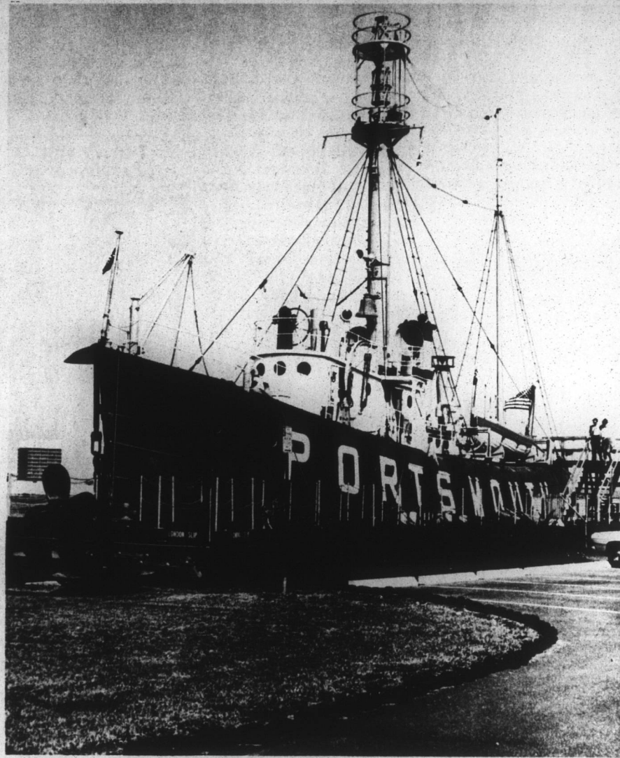
REAL ATTRACTION —Ready for a sail? No, this ship is grounded for a good reason—it serves as the Portsmouth Lightship Museum, telling the story of the U. S. Coast Guard. Inside is all the crew's equipment and uniforms used when the ship was in service as a lightship. Located at the end of High Street in Portsmouth, the museum will be open from 10 A. M. to 5 P. M. during Portsmouth-Norfolk Good Neighbor Days, October 11 and 12. These two days will be filled with opportunities to sightsee, attend theaters, see a football game and browse through fascinating museums like the Portsmouth Lightship.

Each animal will be identified with a card attached to its pen. Feeding times will be announced so children may watch. No admission fee will be charged.