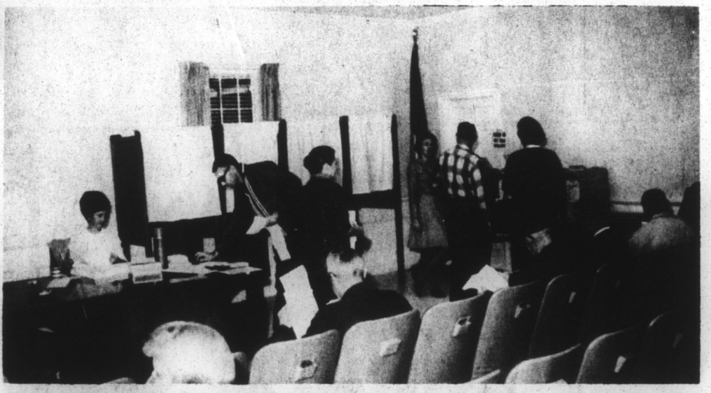
ACTIVITY BRISK AT POLLS-Election officials in Chowan County were kept busy as a record number of voters went to the polls. The above picture was taken during mid-day balloting at West Edenton Precinct, voting in the Municipal Buildng. Many voters, not waning to wait to get into a booth, marked their ballots from the first row of the Council chamber.