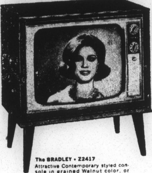
The BRADLEY - Z2417 Attractive Contemporary styled console in grained Walnut color, or grained Mahogany color. 22,000 Volts Picture Power. 5 1/4" Oval Front Mounted Speaker.

HANDCRAFTED LONGER TV LIFE! Carefully handwired chassis connections for greater operating dependability, fewer service problems. This means longer TV life.