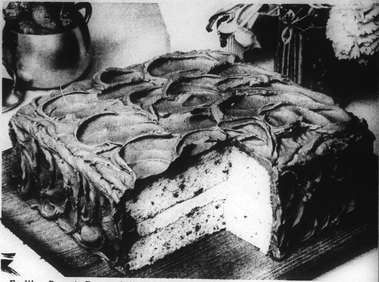
Exciting Dessert —Banana Split Cake is an exciting dessert for a spring luncheon if you're not counting calories. It is made with some new Red Band mixes now on the market.