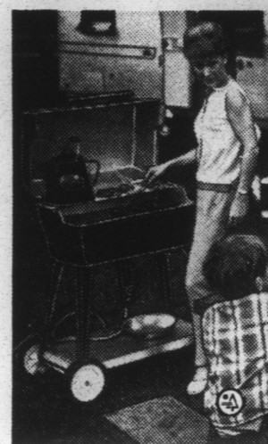
Pack a portable Charmelox gas grill in the trailer and Mother can enjoy outdoor life even while she cooks.

To keep warm, dry and safe when you go camping, make sure the gas heater in your camper or trailer • is vented directly through the roof, never through the side or walls; • bears the American Gas Association's Certification Seal; • has an automatic positive shut-off, not just a hand valve shut-off; • gets an ample supply of fresh air through holes in the flooring underneath it, or through louvers or ventilators. Ask your local health department, gas utility or LP gas dealer where to have the camper or trailer checked to see that proper combustion is provided without using up the oxygen in the trailer.