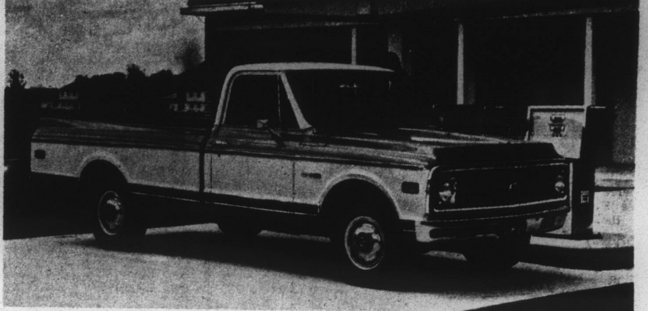
Front disc brakes as standard equipment on all but Chevy Vans highlight the many improvements in the 1971 Chevrolet light truck line. The disc brake system has a proportioning device for more balanced braking between front and rear wheels. Also new are a more massive looking grille, improved cab seating and ventilation, and more powerful headlamps. All engines will operate on the new lower lead fuels and meet required Federal emission standards.

In the South a hog is a local expression for a whopper bass.—Sports Afield.