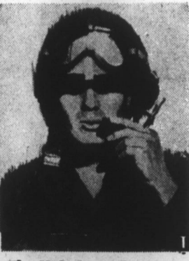
The U.S. Army Reserve.