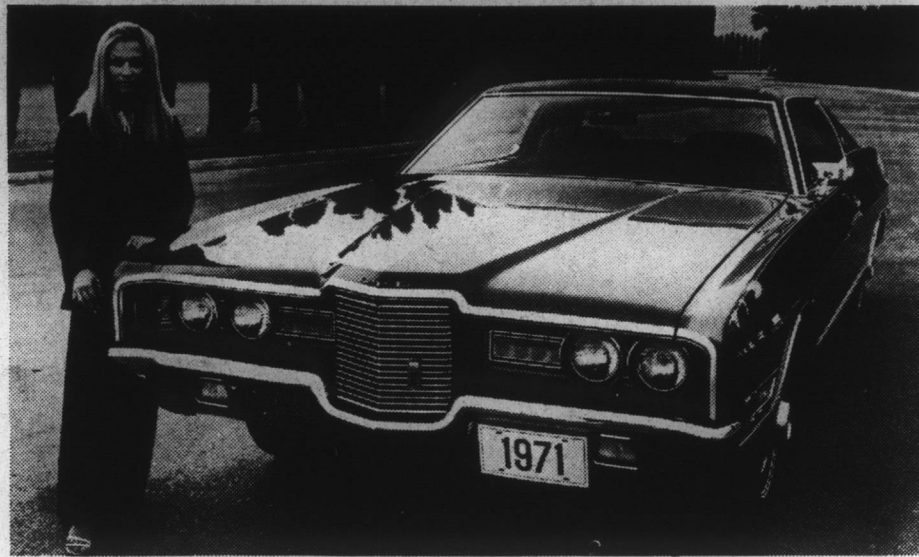
The 1971 Ford LTD is highlighted by this new front end treatment featuring a forward-thrusting center grille section and dual exposed headlamps. This LTD two-door Brougham includes a new, standard high back bench seat which eliminates the need for separate headrests. Ford's new side impact protection system, flush door handles, concealed windshield wipers and a new two-tiered, coved instrument panel also are standard features of the 1971 Ford.

Fewer than 100 of the 18,000 incorporated towns and cities in the United States are properly lighted, according to Amos Landman, educational director of the Street and Highway Safety Lighting Bureau. "It's a toss-up whether someone walking the streets at night will be the victim of a driver who can't see him or of a mugger he can't see," Landman said. Citing the 11 percent rise in crime nationwide in 1969, Landman added: "We must mount a massive campaign to bring our streets out of the darkness, to make them at least as safe as they are during the day. With so many worthwhile activities competing for our attention—spectator sports, theatre, political activities, sandlot baseball, jobs, shopping, and just visiting friends and neighbors—it's unthinkable that so many are afraid to leave their homes after dark."