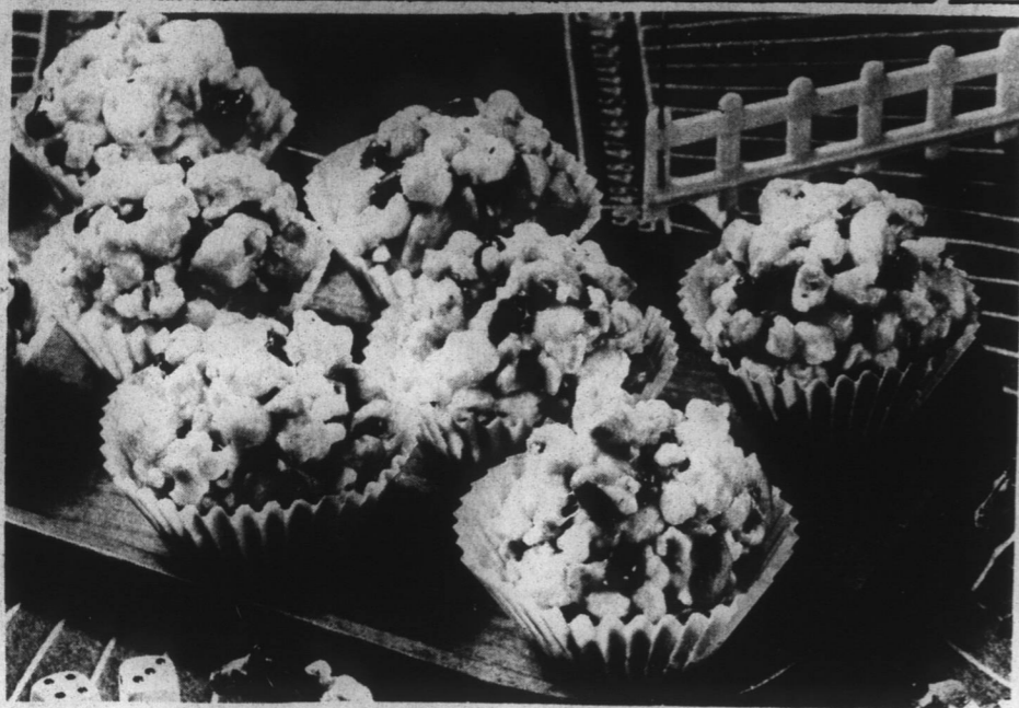
LUNCH BOX TREAT —One way over the lunch box hurdle is with a combination of teen favorite snacks making up Nutty Popcorn Cups. Serve them in frilly paper cupcake liners.

PAGE THREE THE CHOWAN HERALD, EDENTON, SEPTEMBER 17, 1970.