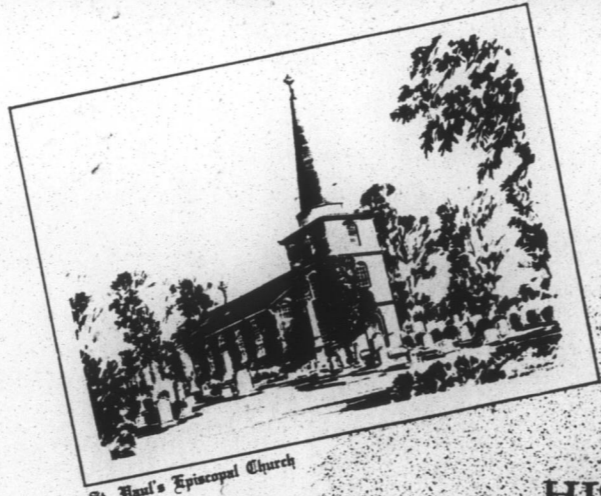
St. Paul's Episcopal Church