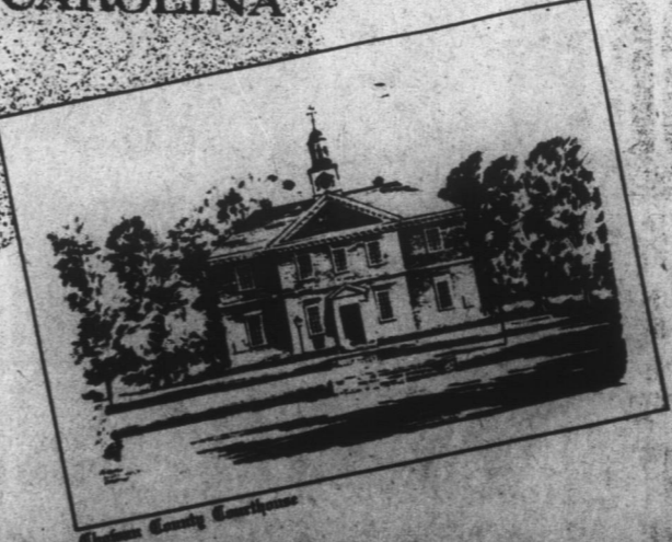
Chowan County Courthouse