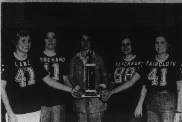
AWARDS PRESENTED —Trophies were recently presented to winning teams in Edenton-Chowan recreation league volleyball. In the far left photo are the Tooth Fairies, who were the Double Elimination Tournament winners. Center photo shows the