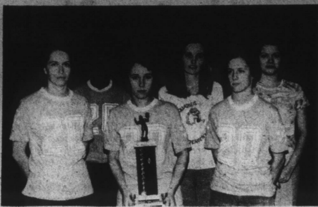
Tournament Runner-Up winners from Dye Plant and at right is the People's Bank team which was presented the Sportsmanship trophy.