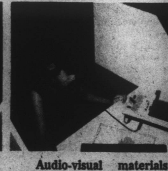
augment standard classroom curriculum