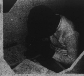
Offices provide a privacy for individual con-

Students receive indiattention guidance from trained, dicated men and women