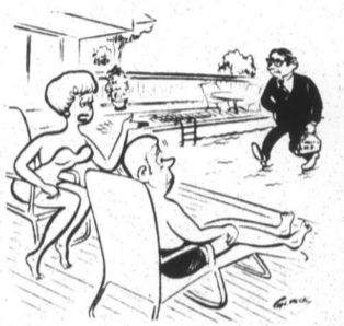
"There, now, maybe you'll have more faith in him."

The man or woman who is really interested in his or her work rarely complains about over-work.