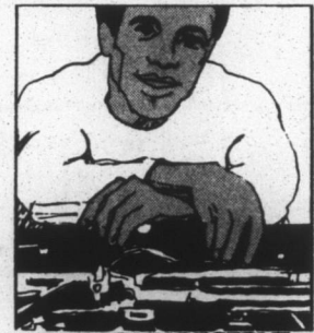
THE ARMY RESERVE. PART OF WHAT YOU EARN IS PRIDE.

What do you like to do on the weekends? Work with electronic equipment, tear down engines, cook? Your hobby could be earning you an extra paycheck in the Army Reserve. Depending on openings, we'll make you an expert, and then give you an excellent part-time job in your specialty.