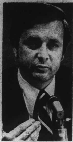
For Governor JIM HUNT