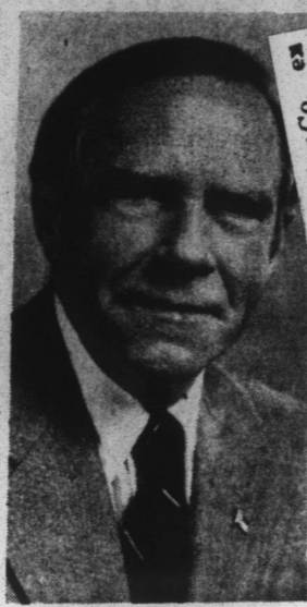
For Lt. Governor JIMMY GREEN