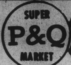
FIGURE ON SAVINGS

Information and referral coordinators from the Area Agency will distribute questionnaires throughout the various areas of Region "R"